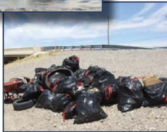
When many individuals collaborate, the results are easy to see. Here 46 bags of trash were collected in El Paso

also carries trash and pollutants into the river. Volunteer groups can work towards cleaning up the tons of trash that contaminate the rivers and its floodplain by adopting a section of the river.