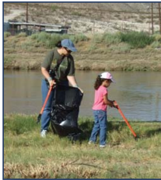
Children learn the value of community service through cleanups

The Rio Grande provides drinking water and irrigation to residents of Las Cruces, NM and El Paso, TX. For a variety of birds, wildlife, insects, and plants, the river provides habitat unlike any other in this arid region.