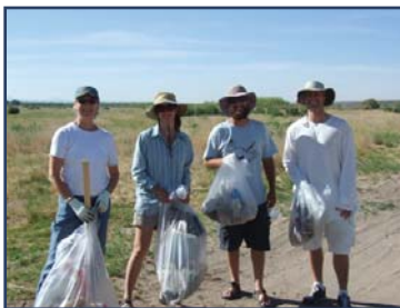
Adopt-a-River participants near Mesilla, NM June 2009

For more details or to sign up your volunteer group, contact the USIBWC Adopt-a-River Coordinator.